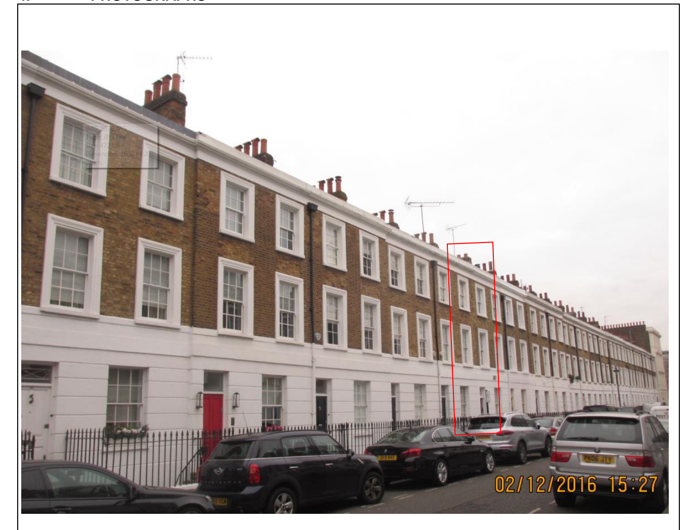
Front elevation no. 31 (in the context of the terrace)