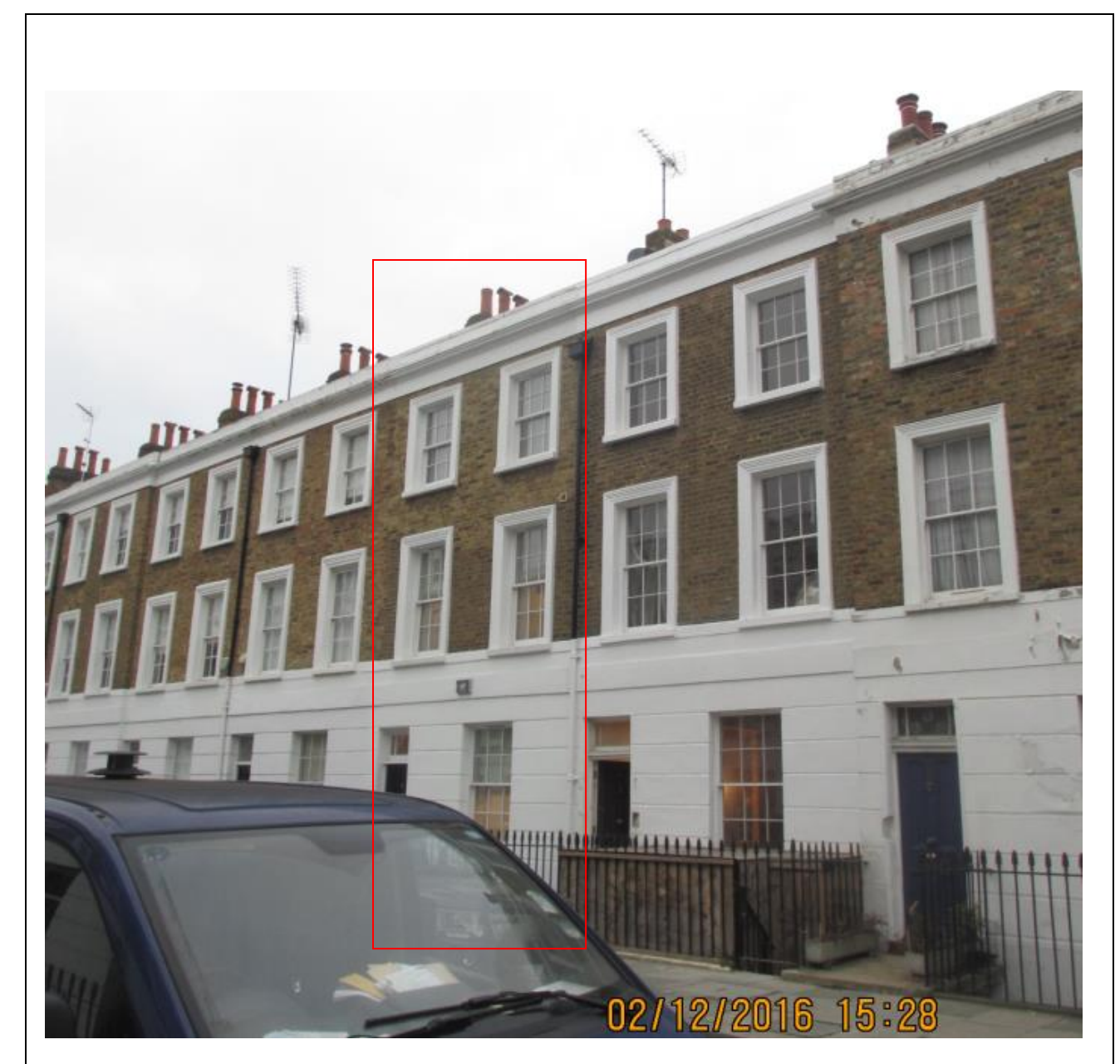
Front elevation no. 31